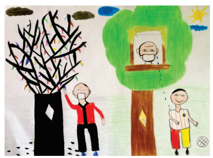
Don't laugh at the kid, it will come to your hand (Drawing by student called K14)