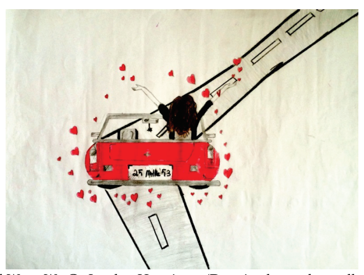
Let All Ways We Go Lead to Happiness (Drawing by student called K23)