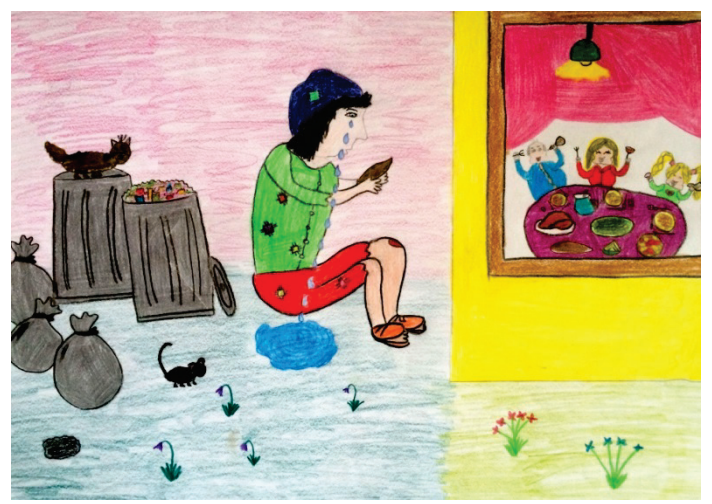
Don't You See Me? (Drawing by participant called K8)