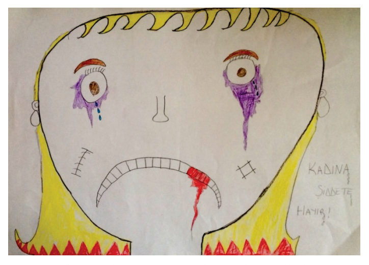
Sniveling Fadime (Drawing by student called E26)