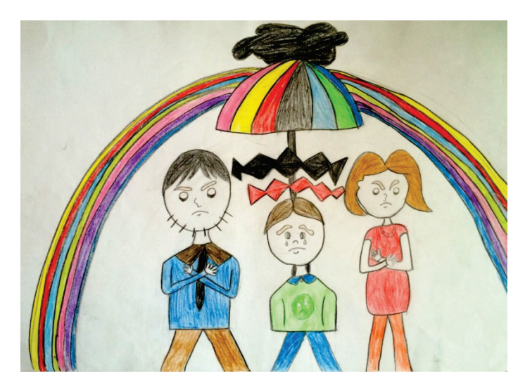
Peaceful lives, colourful thoughts (Drawing by student called K9)